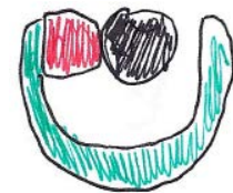
By increasing preload the chamber fills, pushing the septum away from the aortic opening

Heart muscle should be able to contract and relax. Dilated cardiomyopathy has trouble with contractility - getting the blood OUT (systolic failure). Restrictive cardiomyopathy has trouble relaxing - getting blood in (diastolic failure). It can't relax to accept blood because there's “junk in the way.” It's caused by Sarcoid, amyloid, hemochromatosis, cancer, and fibrosis as well as other causes that are really rare. Treatment is tricky – it's necessary to maintain an adequate preload while not overloading the pulmonary vasculature. Gentle diuresis and heart rate control are essential. Transplant in refractory cases.