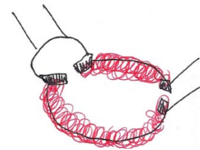
All the junk in the myocardium won't let the heart relax / fill

Heart muscle should be able to contract and relax. Dilated cardiomyopathy has trouble with contractility - getting the blood OUT (systolic failure). Restrictive cardiomyopathy has trouble relaxing - getting blood in (diastolic failure). It can't relax to accept blood because there's “junk in the way.” It's caused by Sarcoid, amyloid, hemochromatosis, cancer, and fibrosis as well as other causes that are really rare. Treatment is tricky – it's necessary to maintain an adequate preload while not overloading the pulmonary vasculature. Gentle diuresis and heart rate control are essential. Transplant in refractory cases.