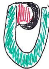
The hypertrophied septum , growing from the normal septum overrides the aortic opening

An autosomal dominant mutation of myocyte sarcomeres , this causes an asymmetric hypertrophy of the septal wall. Since it occludes the aortic outlet it presents just like an aortic stenosis except that it's heard at the apex and improves with increased preload . Why? Because increased preload causes the ventricular chamber to fill, pushing the septum away from aortic outlet and letting blood flow. This is the opposite of aortic stenosis. Also, HCM is found in young people while AS is found in the elderly. Symptoms may be SOB (most common) , angina, or what people know it for: sudden death in athletes . Treat this by avoiding dehydration and with \beta -Blockers to allow an increase in ventricular filling.